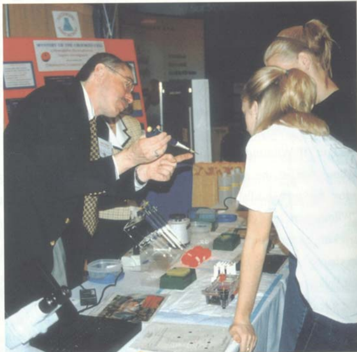
Two students pause to peruse an IT demonstration.